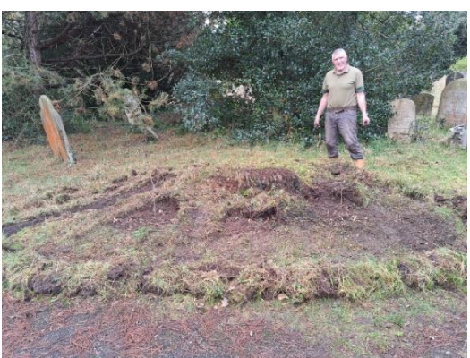
Before and after images of Paul Robards creating a designated area to attract wildlife