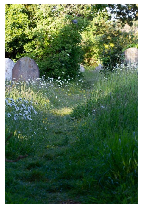
I have many images of the more formal pathways, which I am sure many of you walk regularly.