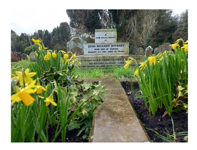
The Richard Jefferies' grave in Broadwater & Worthing Cemetery